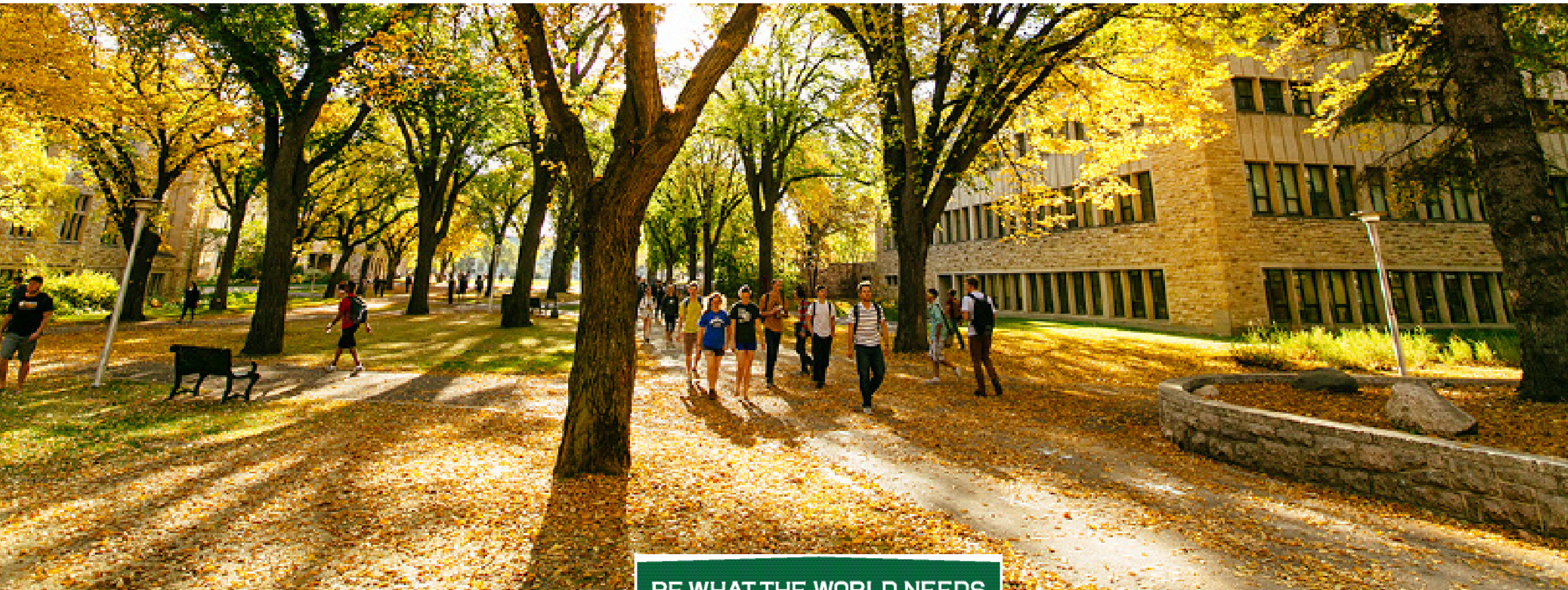
BE WHAT THE WORLD NEEDS

Foster an entrepreneurial campus spirit and utilize the campus operations and community as a living laboratory to pilot and then diffuse and scale sustainability solutions.